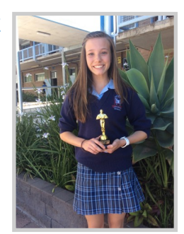
BEST ACTOR - MALE