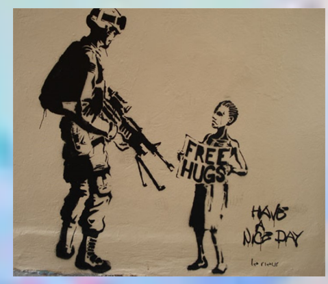
Banksy, Free Hugs, 2009

At the end of last term, as part of the St Pauls Day festivities, Year 8 Visual Arts staged a 'Pop up' Street Art Exhibition called 'Free Hugs'. Influenced by the work 'Free Hugs' by Banksy, our exhibition was created to raise awareness about the impact of war on children. The UN reports that 5.5 million children have been affected directly by violence or indirectly by starvation, mutilation, displacement or lack of access to health services, because of war. In particular, more than 11,000 children have died because of the war currently occurring in Syria's. This war has turned millions of people into refugees without proper clothing, food, water or shelter. Many of these starving refugees are children, and newborns in hospitals who are freezing to death. Other young children have been targeted by snipers when their families have tried to flee the conflict. The exhibition called attention to the impact of war through powerful and heart-wrenching pieces of artwork. The students works were a symbol of our hope for peace for those innocent children caught up in wars. The exhibition was very well received by