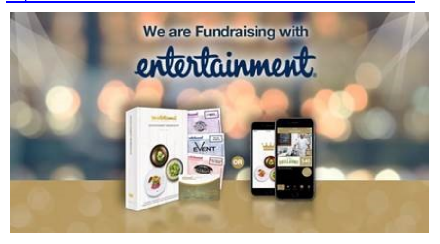
Go to the link below to Order yours Now