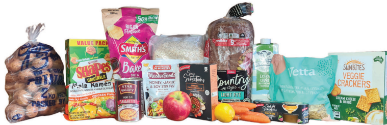
Typical hamper contents**

3/6 The Boulevard, Toronto (Behind LJ Hooker)