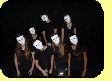
Yr 10 Drama performing "Beautiful Noise"