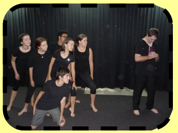
Yr 10 Drama in "Secrets"