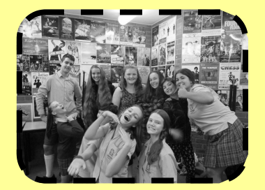
Yr 9 Drama preparing for their first performance in Drama!