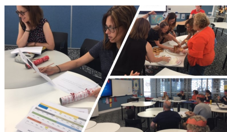
PLT PD Day 17 December – Building a Culture of Collaboration